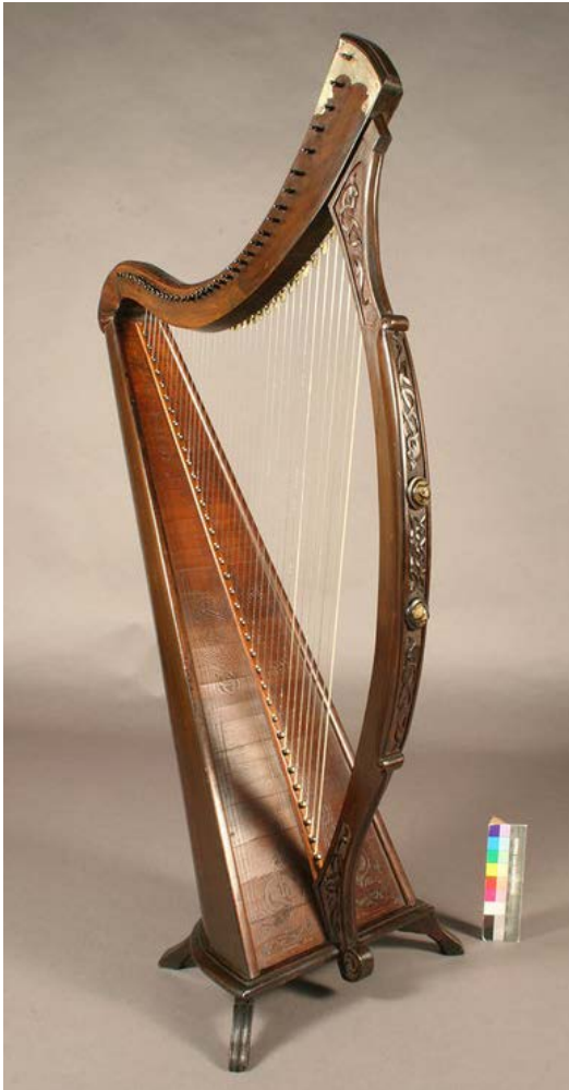
Figure 2. McFall Tara harp.