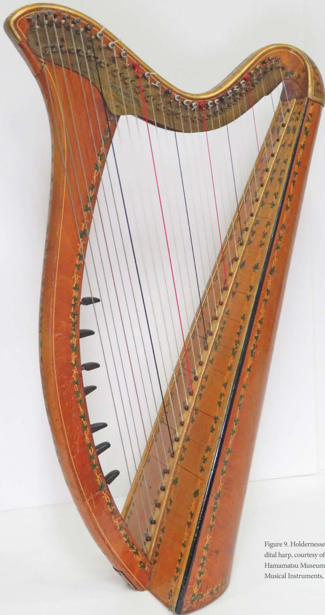
Figure 9. Holderness digital harp, courtesy of the Hamamatsu Museum of Musical Instruments, Japan.