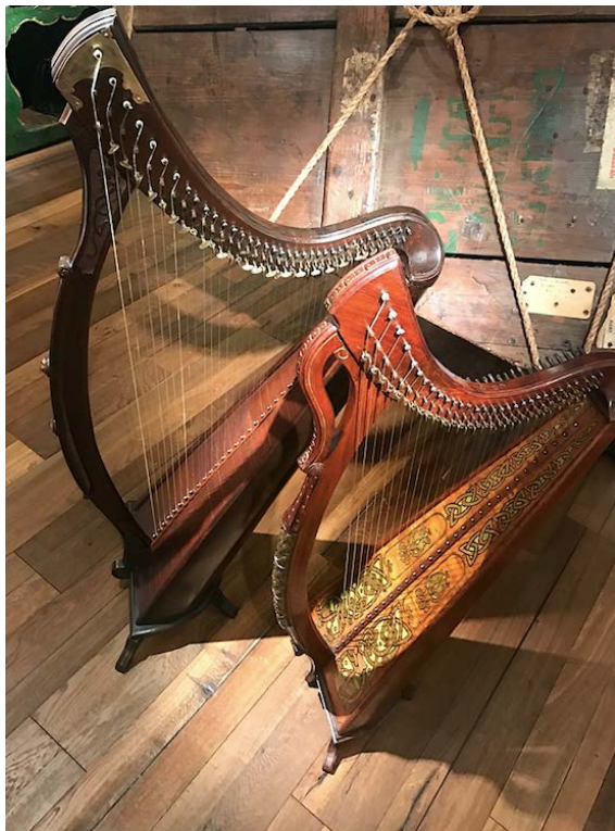
Figure 12. McFall Tara and Bardic harps, courtesy of The O'Brien Collection.

McFall's approach was to design a contemporary gut-strung harp in a pseudo-ancient-looking body. He adopted a bowed-pillar contour and high-headed shape and copied the rounded sound chamber of Egan's Improved Irish Harp. Initially McFall harps were available with either gut or wire strings, 30 but later the stringing was model-specific. McFall added a novel feature of placing the harp body on a slightly raised platform held up by four 'feet.' In decoration, the harps messaged an Irish medieval style. The pillar carvings had zoomorphic motifs with Celtic knotwork, and on the outer pillar were raised decorative jewel settings reminiscent of the Trinity College Harp. On the soundboard, painted interlaced patterns and fantastic beast motifs were inspired by early Christian manuscripts. The model name, 'Tara', suggested the former seat of the high kings of Ireland. In a medieval guise, the instrument was actually a modern chromatic gut-strung harp with adjustable ring stops for key changes (Figure 12). The maker's signature on harps reflected his achievement: 'James McFall / Maker and Reviver of the Irish Harp / 22 York Lane / Belfast'.