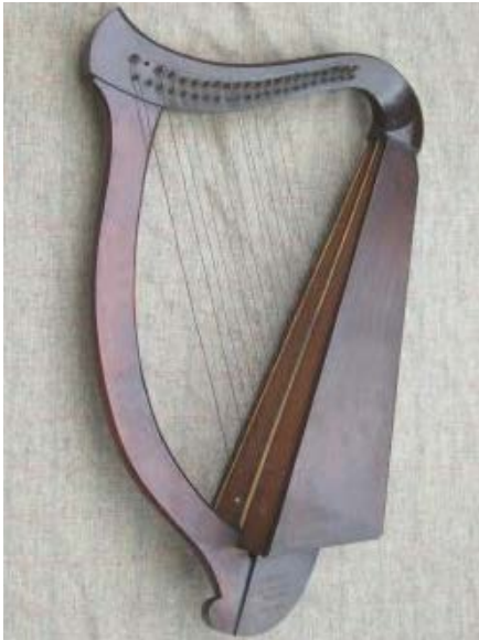
Figure 14. McFall Minstrel harp.

distinction between his wire harp model made for the masses and his larger gut-strung harps, which were suitable for ‘convents and virtuosi’. The gut-strung harps with chromatic action were advertised as meeting the ‘requirements of modern music’, but McFall was keen to point out that they were ‘no less a genuine Irish harp’. 34