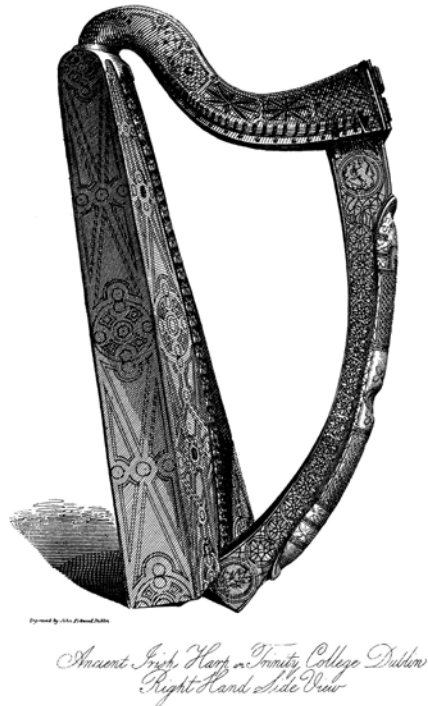
Figure 4. Trinity College Harp in the 1840 Bunting collection.

Scottish and Welsh tunes and also Thomas Moore songs. In his signature piece, ‘Brian Boru’s March’, the range of soundscapes was described as ‘a whisper like the sigh of the rising wind on a summer eve’, continuing with ‘fairy music heard from a distance’, and then rising to a ‘clang with a martial fierceness’. 11