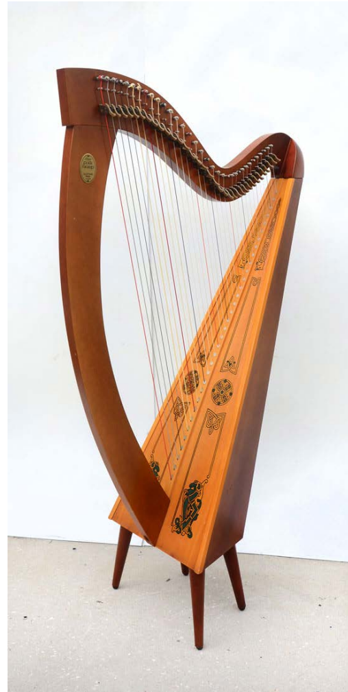
Figure 15. Lyon & Healy Folk Harp.

The McFall harp shape, with medieval-style carvings and Celtic decoration successfully strengthened a connection to the ancient Irish harp, albeit in decoration only as opposed to organology. However, it was Egan who invented the lasting concept of a modern Irish harp – a small, portable, affordable, gut-strung harp with a bright tone and mechanisms for playing in different keys – an instrument suited to the music people wanted to play.