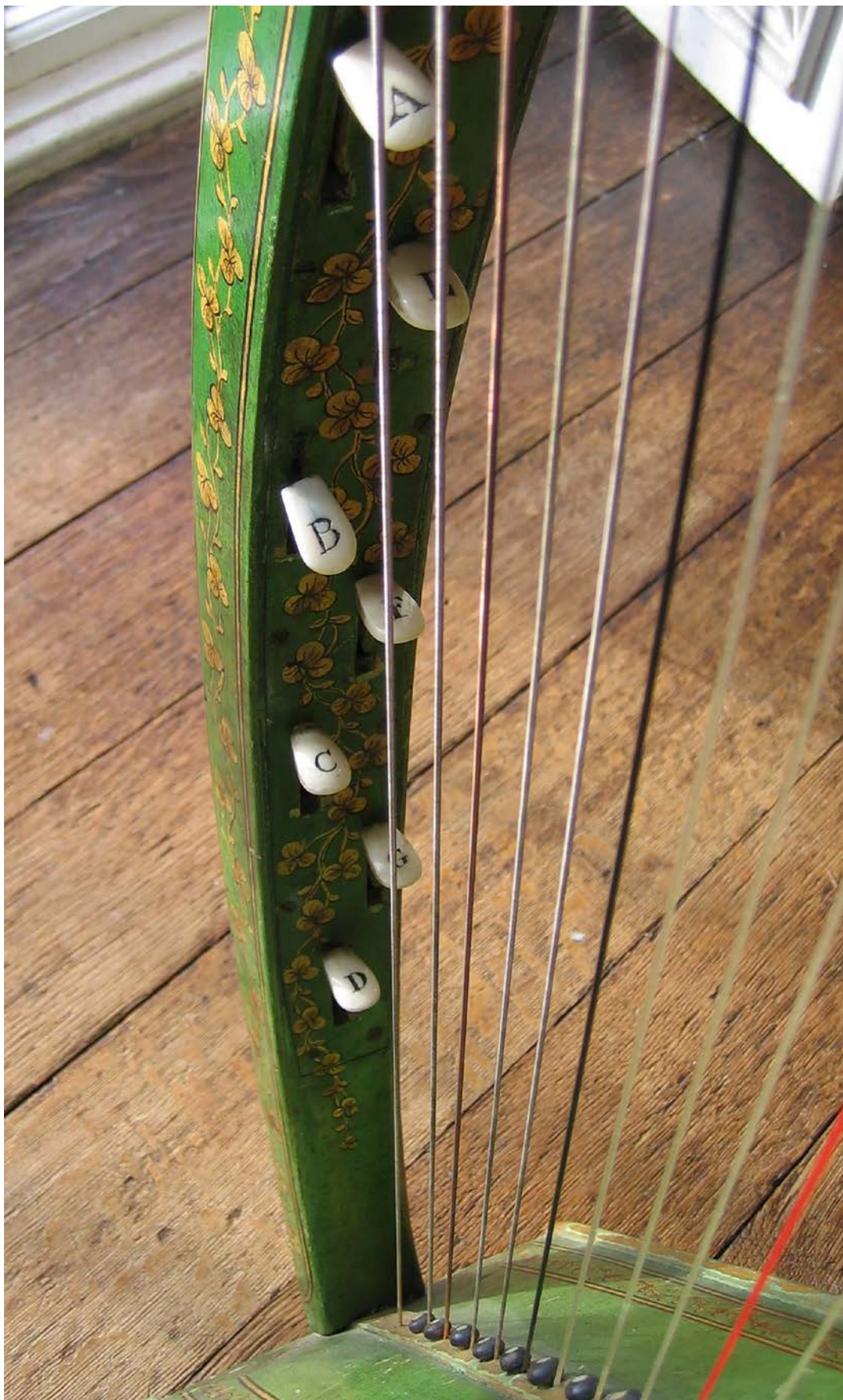
Figure 6. Ditals on an Egan Portable Irish Harp, courtesy of Oxmantown Settlement Trust, Birr Castle.