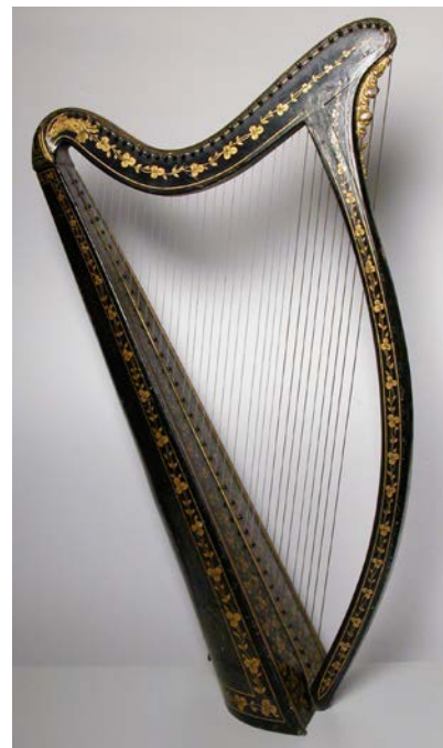
Figure 1. Egan Portable Irish Harp at Snowhill Manor, England.

In the first critical phase, the early Irish harp, or wire-strung cláirseach 1 played for centuries, had finally died out by 1800, despite revival attempts by the Belfast Harp Society. 2 Efforts continued with special schools set up by harp societies in Belfast and Dublin to teach wire harp repertoire and techniques to the next generation. The societies commissioned John Egan to make wire-strung harps for the schools. 3 At this same time, Egan also invented a new, modernized harp for Ireland called the 'Portable Irish Harp'. The small portable harp with gut strings and sharpening mechanisms, steered the harping tradition in a new direction 4 (Figure 1).