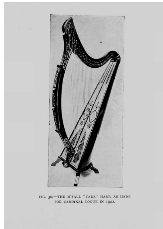
Figure 13. McFall Tara harp made for Cardinal Logue in Flood's The Story of the Harp , 1905.

One of the first Tara harps made was for Cardinal Logue in 1902, called the 'Armagh Harp'. An image of the instrument appeared in Grattan Flood's 1905 publication, The Story of the Harp (Figure 13). The soundboard featured Celtic interlace and disks painted by artists in the Irish Decorative Art Association of Belfast. The harp debuted at the Irish Harp Festival held in the Linen Hall Library on May 8-16, 1903. 31 The festival included a week-long exhibition of instruments (including the harps of O'Neill and Hempson) and historical artefacts from the Belfast Harp Festival of 1792. Several new harps by James McFall were on display, and they were played in the festival concert held on the 8 th of May. Seven harpists performed, including Owen Lloyd, Florrie Kerin, and Emily MacDonald and also the harp maker's son, Master Malachy McFall. 32 The music played was Irish ballads, traditional tunes, and pieces by Carolan and Thomas Moore.