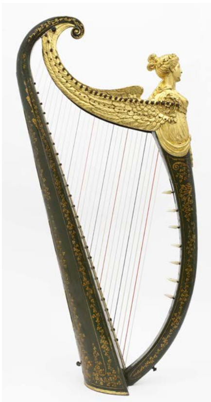
Figure 8. Egan Winged-maiden Portable Irish Harp, courtesy of the Royal Academy of Music Museum, London.

within reach to a wider segment of society, at least for a time, numbers of players increased.