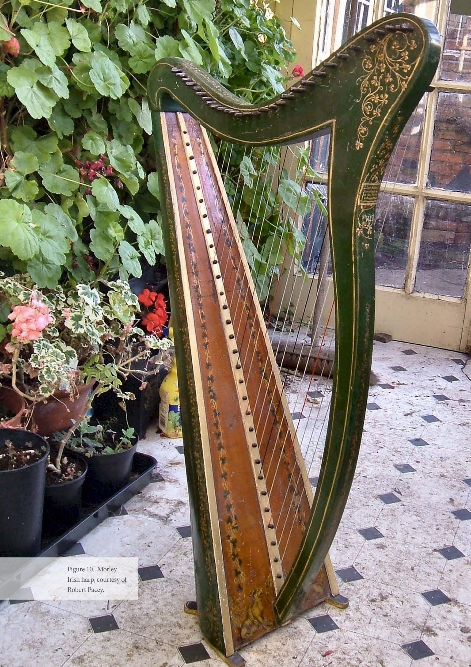
Figure 10. Morley Irish harp, courtesy of Robert Pacey.